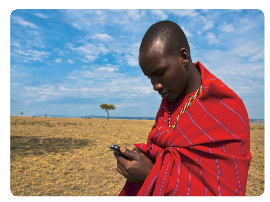
Huawei's TD-LTE solution increased the penetration of broadband services in Africa

Given that Africa has rigid demands for broadband access but lacks fixed network resources, wireless broadband becomes especially important for bridging the digital divide in Africa. With its ultra-high downlink bandwidth and industry chain maturity, Huawei's TD-LTE solution effectively improves the