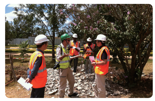
Huawei's executives are conducting security check at the engineering delivery site

To meet customer requirements and comply with applicable laws and regulations, Huawei has set up specialized departments for Environment, Health, and Safety (EHS) management of subcontractors and engineering delivery activities through cooperation with subcontractors. As a result, our delivery employees are protected against health and safety hazards, and our engineering delivery activities will not adversely affect the environment. Huawei has developed four EHS management strategies for delivery projects: "practice EHS leadership and build an EHS culture and atmosphere," "require subcontractors to implement EHS," "apply the minimum EHS standards and comply with EHS absolute rules," and "warn about accidents ahead of time, report violations, and hold violators accountable." These strategies are set to achieve the EHS goal of "zero accidents, injury, and pollution" during project delivery.