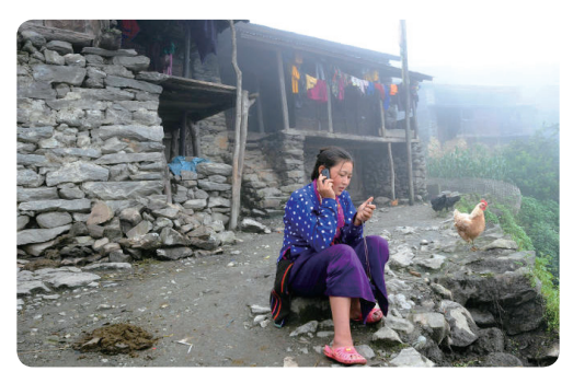
The Huawei SingleSite solution makes communications convenient for Nepalese in mountainous areas

Located in the Himalayas, Nepal is known as the "Mountain Kingdom" as it has many mountains with elevations of over 6000 km above sea level. Nepal's mountainous terrain makes transportation in this developing country rather difficult. In the country, goods are mainly carried by manual labor, oxen, or helicopters. Electricity supply is another major challenge for the country. Every winter, some areas of the country suffer from power outages of up to 16 hours every day. Carriers in Nepal have long been troubled by such issues as difficult construction of common base stations, long construction periods, and high construction costs, and thus have been unable to more effectively promote local