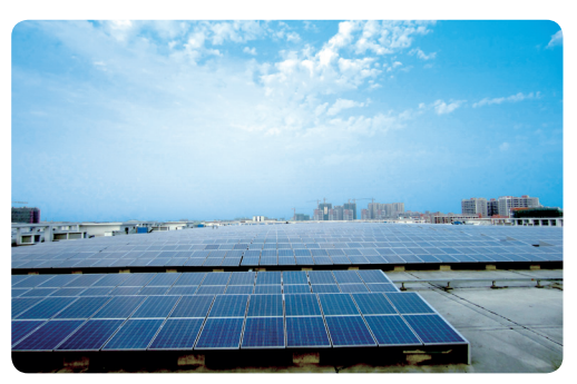
Solar power stations at Huawei's Dongguan Campus

In addition, Huawei plans to build solar power station projects at other Huawei campuses, including Shenzhen, Hangzhou, and Nanjing. Once these stations are put into use, they will generate more